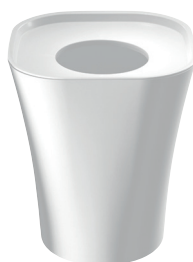
Matt colour White 1730 C