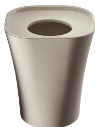
Matt colour Beige 1450 C