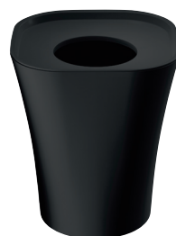
Matt colour Black 1750 C