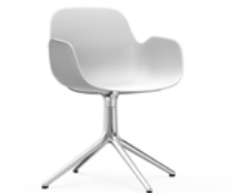
Form armchair swivel 4L H: 80 x L: 70,5 x D: 70,5 x SH: 44 x AR: 66,5 cm