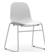
Form chair stacking steel, chrome H: 80 x L: 58,5 x D: 52 x SH: 44 cm