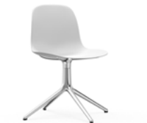
Form chair swivel 4L H: 80 x L: 70,5 x D: 70,5 x SH: 44 cm