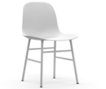
Form chair steel, chrome, brass H: 80 x L: 48 x D: 52 x SH: 44 cm