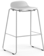
Form bar stool 75 cm stacking steel, chrome H: 77,5 x L: 60,5 x D: 48,5 x SH: 75 cm