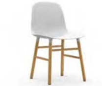
Form chair wood H: 80 x L: 48 x D: 52 x SH: 44 cm