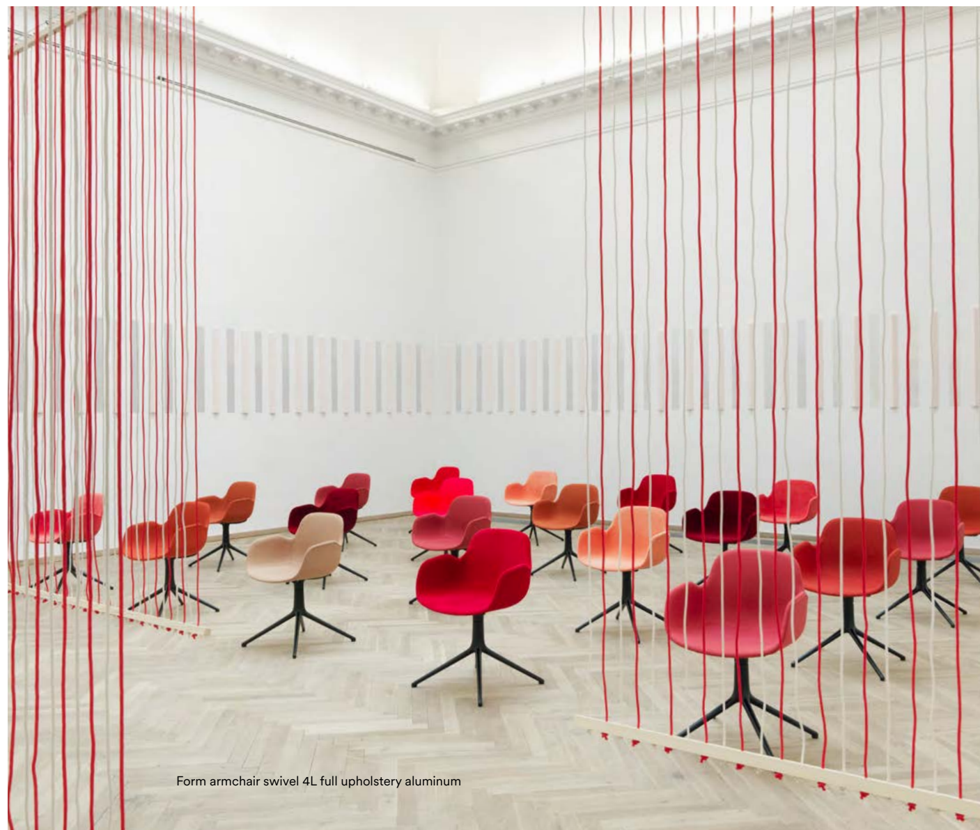
Form armchair swivel 4L full upholstery aluminum

We recommend to check and tighten screws every 3-6 months. Please make sure your choice of glides is suitable for the type of flooring. We recommend to check the glides every 3-6 months. If worn down, please replace.