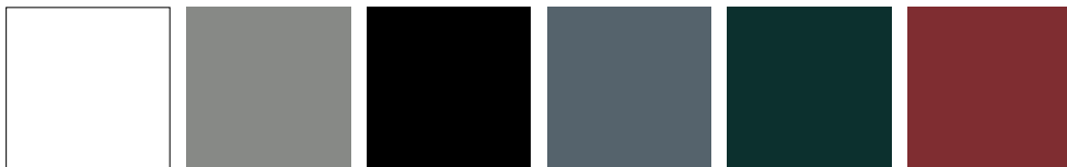
White Grey Black Blue Green Red