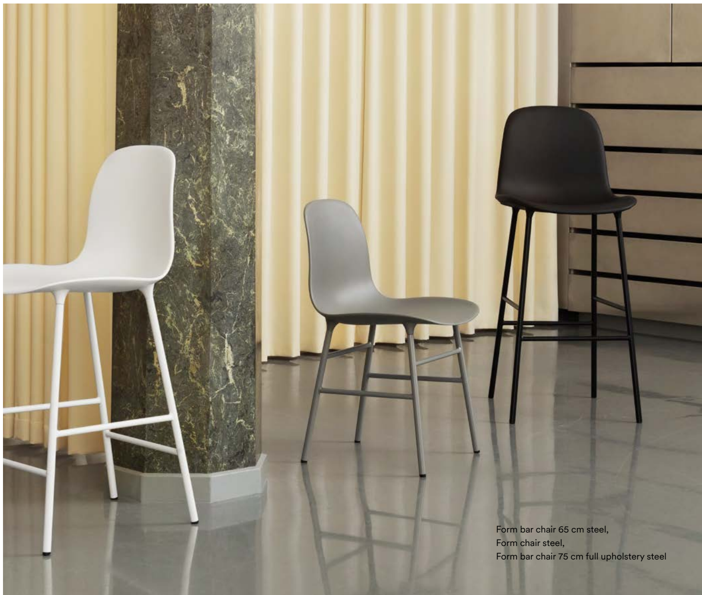
Form bar chair 65 cm steel, Form chair steel, Form bar chair 75 cm full upholstery steel