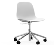
Form chair swivel 5W gaslift H: 73/86 x L: 60 x D: 52 x SH: 37/50 cm