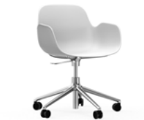
Form armchair swivel 5W gaslift H: 73/86 x L: 72,5 x D: 72,5 x SH: 37/50 x AR: 59/72 cm