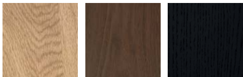
Oak Walnut Black