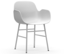
Form armchair steel, chrome, brass H: 80 x L: 56 x D: 52 x SH: 44 x AR: 66,5 cm