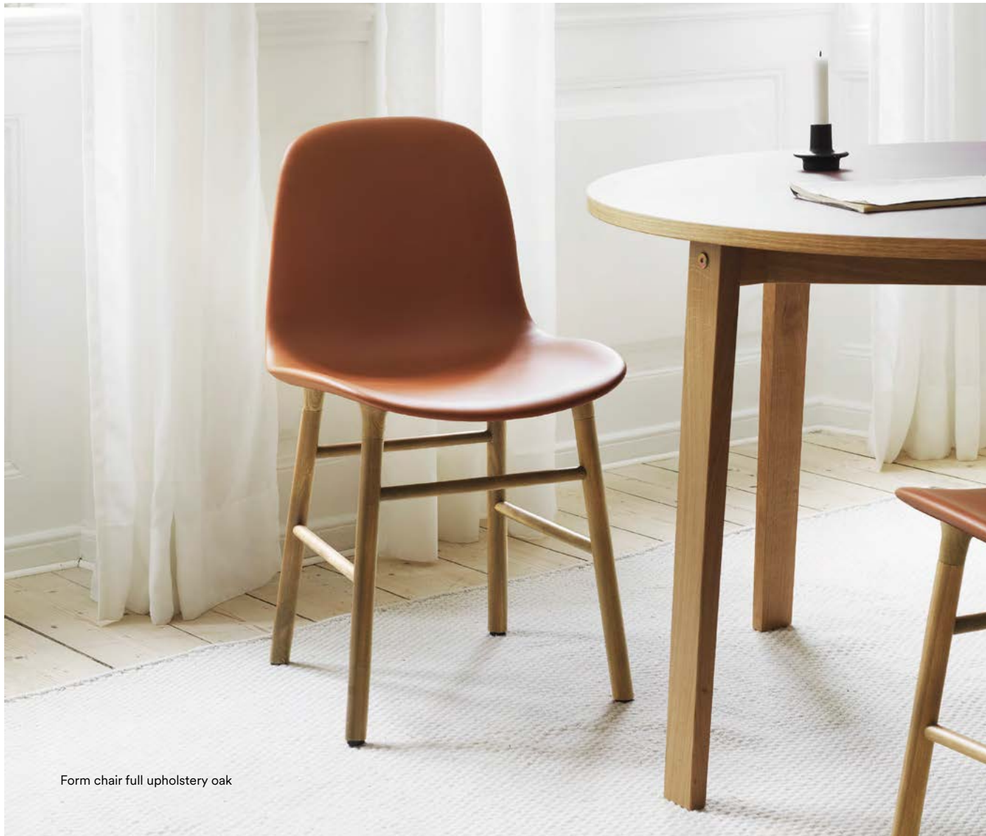
Form chair full upholstery oak