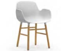
Form armchair wood H: 80 x L: 56 x D: 52 x SH: 44 x AR: 66,5 cm