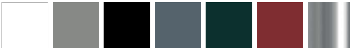
White Grey Black Blue Green Red Chrome