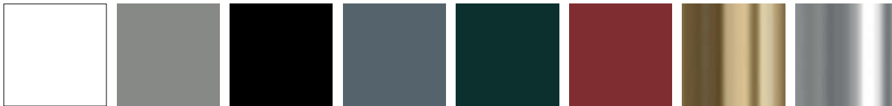
White Grey Black Blue Green Red Brass Chrome