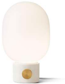
Light Grey/Brass 1800129