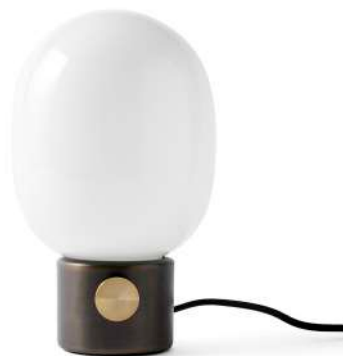
Bronzed Brass 1800859