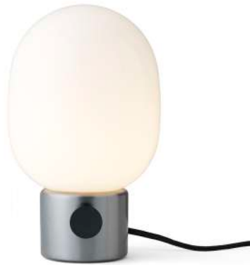
Brushed Steel 1800039