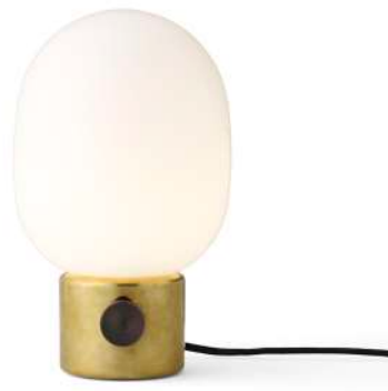
Mirror Polished Brass 1800839