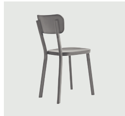
Sand Beige 5269