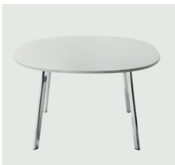
Legs: Polished Aluminium Top: MDF or HPL White 8500