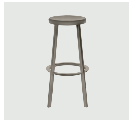
Sand Beige 5269