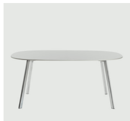
Legs: Polished Aluminium Top: MDF or HPL White 8500