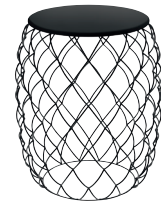
Outdoor use Frame: painted Black 5140 Top: HPL Black 8510