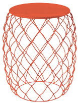
Indoor use Frame: painted Coral Red 5084 Top: Ash painted Coral Red