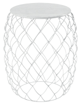
Indoor use Frame: painted White 5108 Top: Ash painted White