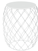
Outdoor use Frame: painted White 5108 Top: HPL White 8500