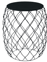
Indoor use Frame: painted Black 5140 Top: Ash painted Black